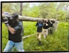
WV Mountain Bike Festival participants build bridge across Devil's Run