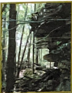
View along Splash Dam South Trail