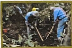
Retired smokejumpers work on Davis Trail

***** Annual Stakeholders Meeting October 19, 7:00 p.m. at Blackwater Falls State Park Lodge Everyone is welcome.